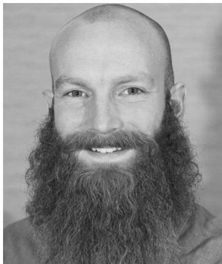
Candidate for Place 1

See Page 8 for a to find your polling location