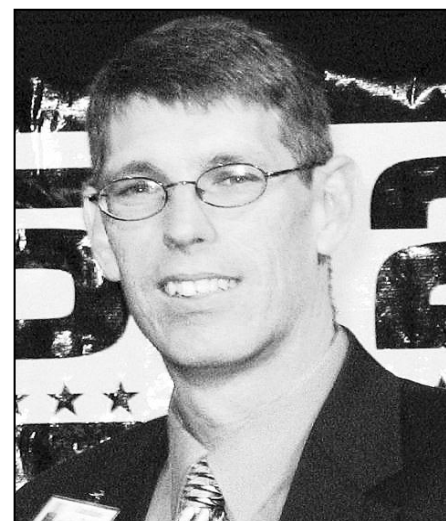
Candidate for Place 3

The primary reason I am running against the incumbent is her reputation for inaccessibility. If elected, I will be a leader who proactively seeks input from every part of the community and translates that input into real action and meaningful solutions. I ask for your vote.