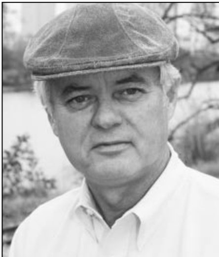
Candidate for Place 4