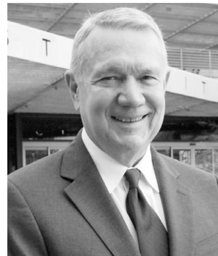
Candidate for Place 1

As Councilman, my door will always be open to any group who wishes to speak with me. The lack of citizen and public input is a common complaint I hear while campaigning. I vow to set up recurring meetings with citizen groups to hear and understand their concerns.