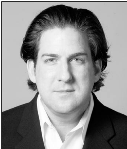
Candidate for Place 1