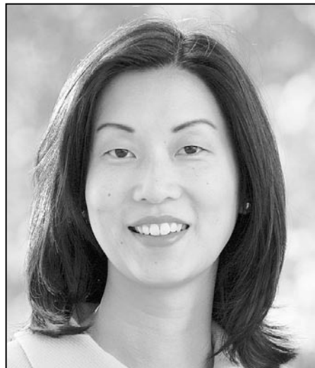
Candidate for Place 3

I will create a Department of Neighborhoods to engage neighborhoods and their residents in civic participation. We must respect that different neighborhoods have different perspectives. I seek to involve all of Austin's residents in a more effective and purposeful civic discourse.