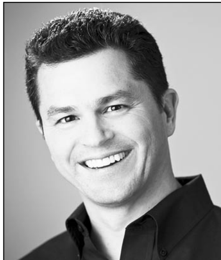
Candidate for Place 4

We as a city need to ensure that the growth we experience is channeled in directions that are positive for our community. The city needs a new comprehensive plan for growth. If elected I plan to implement a new comprehensive planning process which will involve input from neighborhoods, stakeholders, and citizens.