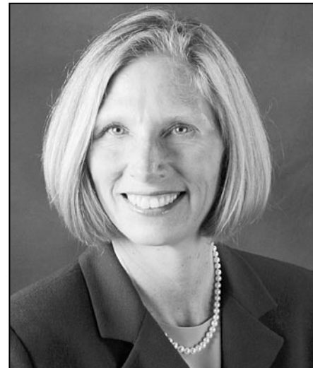
Candidate for Place 4

I will have neighborhood meetings in every part of the city. An elected official should go to every neighborhood in this city to hear and know what the issues and concerns are.