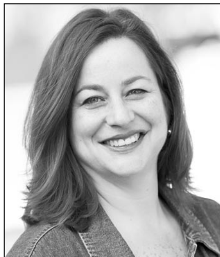
Candidate for Place 3

I held a townhall meeting in Oak Hill to better understand their needs and to discuss projects in the budget and bond initiative that would benefit their neighborhood. I would like to do the same in Far South Austin should I be re-elected to the council.